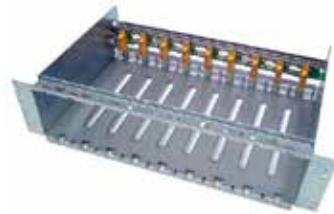
Rack 9 x ZR2048