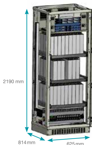
TELSIS ZGR APS 48 V 27 kW *