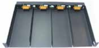
Rack 4 x ZR2048