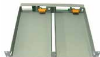
Rack 2 x ZR3048 or 2 x ZR30110