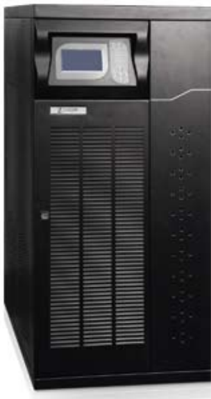
Ottawa 40 KVA

Advanced diagnostics and unit information allow users to monitor system parameters and alarms, check the status of the battery and provide access to the history of events through the system software or multi-language screen.