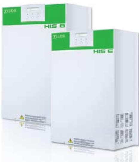
HIS 6 & 8 models

This function allows high energy savings in installations fitted with an emergency power generator. Optionally, they implement management strategies oriented towards energy saving.